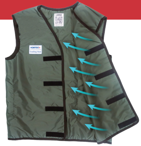
COLD AIR DISTRIBUTION

The distributed air temperature differential is +/- 60°F (33°C) from the compressed air inlet temperature.