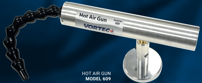
HOT AIR GUN MODEL 609

Hot Air Guns are used where milder heat is needed as compared to an electric heat gun. It is ideal for pre-heating of parts, processes and solutions, with an output flow rate of 2–8 scfm; and is also widely used for softening adhesives, rubber and vinyl, and accelerating drying. The hot air gun requires no electricity at the target, and uses only filtered compressed air to generate fully adjustable temperatures up to 200°F.