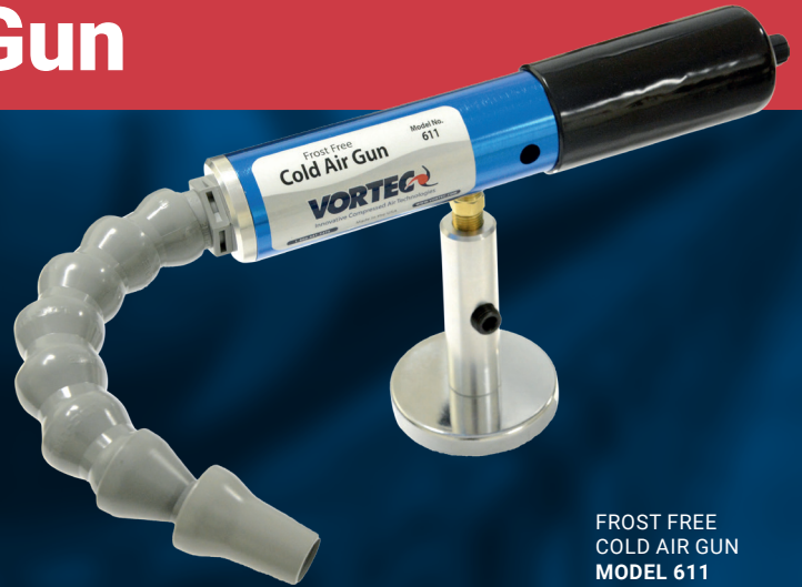
FROST FREE COLD AIR GUN MODEL 611

The Frost Free Cold Air Gun eliminates the mess associated with condensation and frost arising from continuous use of a Cold Air Gun. A must have for sensitive applications such as fabrics, wood, cardboard and paper; as well as standard metalworking applications.