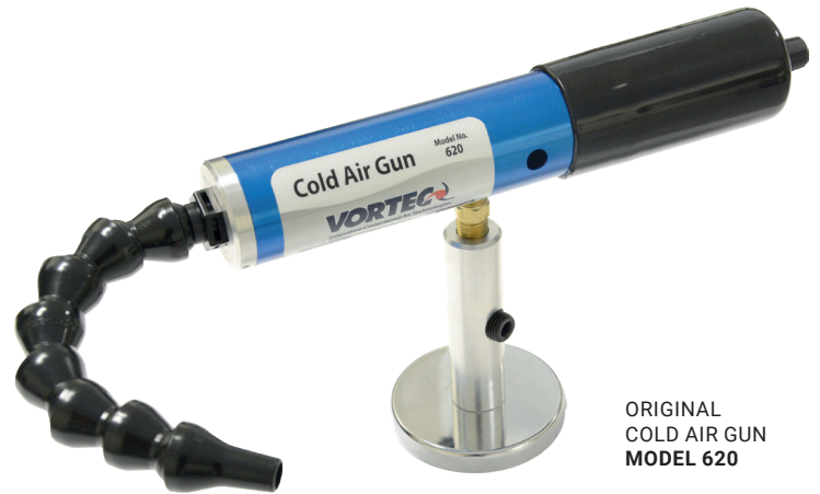
ORIGINAL COLD AIR GUN MODEL 620

The effective cooling from a Cold Air Gun can eliminate heat-related parts growth while improving parts tolerance and surface finish quality.