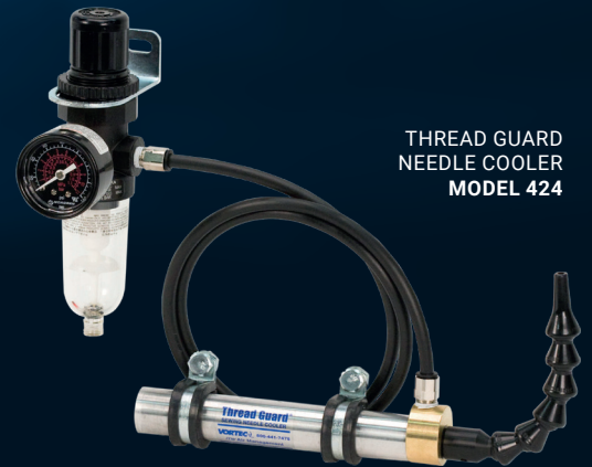
THREAD GUARD NEEDLE COOLER MODEL 424

The air stream is especially effective on difficult sewing surfaces such as belt loops and waist bands; or on tough materials like denim or canvas. Cold air temperature and flow rate are preset to 10°F and 4 SCFM.