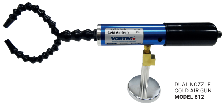
DUAL NOZZLE COLD AIR GUN MODEL 612